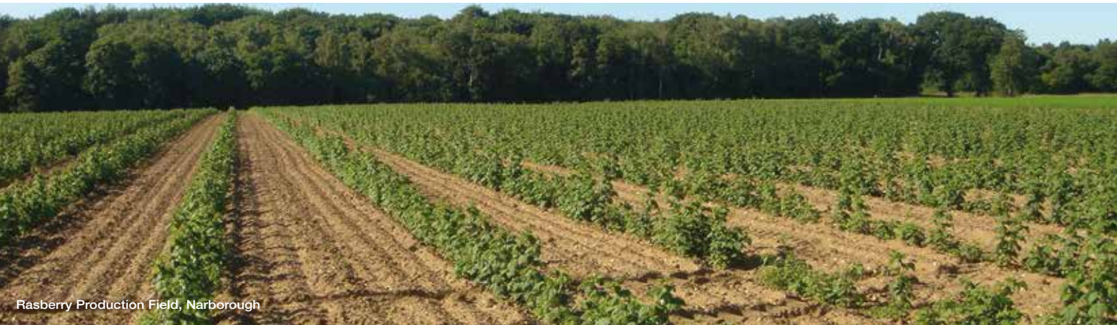
Raspberry Production Field, Narborough