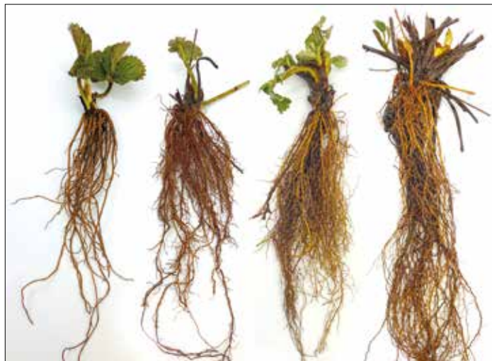
Bare Root Grades - left to right: A-, A, A+, Waiting Bed

The smallest 20% of the runner crop. Ideal for use as a potted plant for subsequent sale.