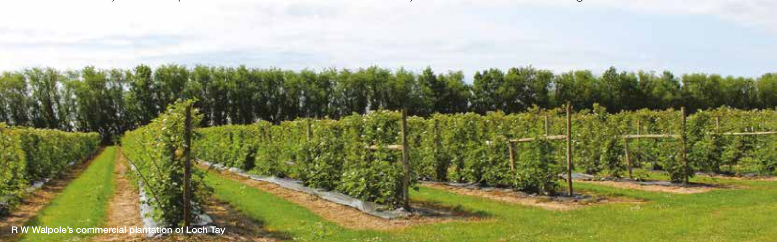
R W Walpole's commercial plantation of Loch Tay